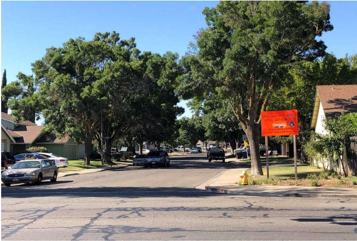
Measure L funding sign in place at Sperry Avenue and 9th Street