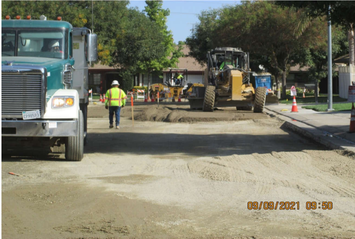
Roadwork on Amerbina Court