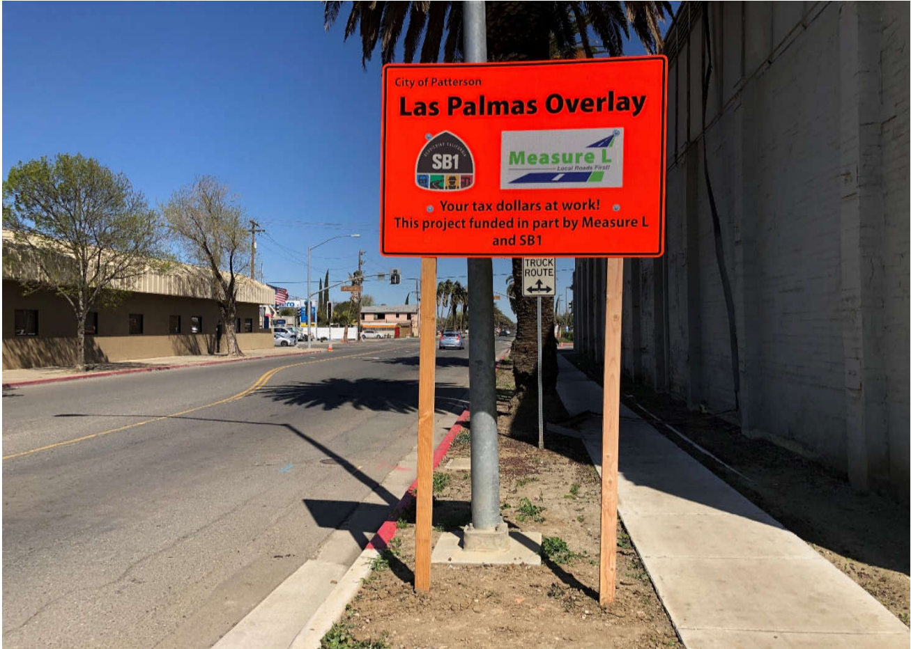
Measure L Funding Sign in Place