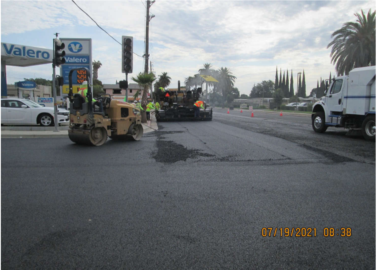
Paving at Las Palmas Avenue and First Street